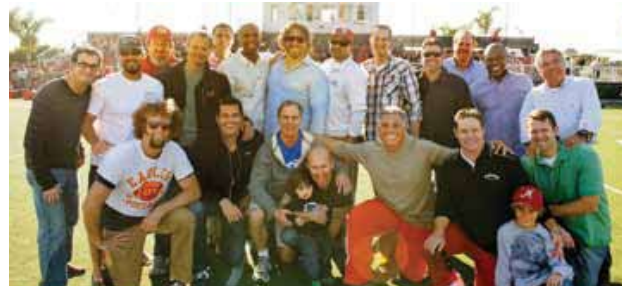
Coaches and players from the 1991 CIF football championship team on the field during halftime of the game on November 5th

SFC honored its first CIF Football Championship team on November 5th, celebrating the 20th anniversary of the "Men of Destiny" at halftime of the football game. Nearly every player and coach from the team was in attendance, several flying in from out of state. The 1991 Eagles went 12-1 and defeated La Jolla Country Day in the CIF Championship game 56-36. Dubbed the "Men of Destiny" by their coaches as Freshman in 1988, the team worked for four years towards their goal of winning SFC's first ever football championship. Even 20 years later, the players and coaches share a strong bond they say will never be broken.